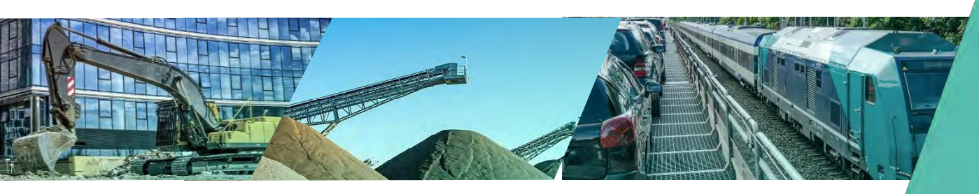
Construction, Real Estate & Infrastructure